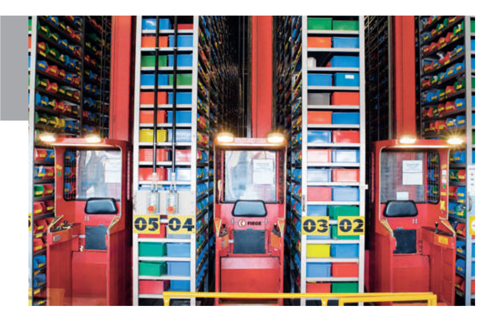
With 3.1 million square metres of storage and logistics space, FIEGE is able to offer a wide range of different logistics services and value-added services according to individual demands.

The joint venture is a continuation of outsourcing into an equal win-win partnership. Combine the logistics skills at FIEGE with the knowledge of your trade. In this way, we pool our individual skills into joint productivity.