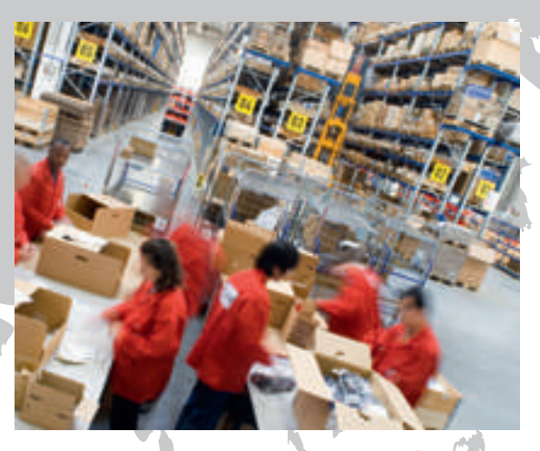
In order to meet profitability and quality demands, FIEGE provides all services required from a lead logistics partner (LLP) in the transport and distribution branch.